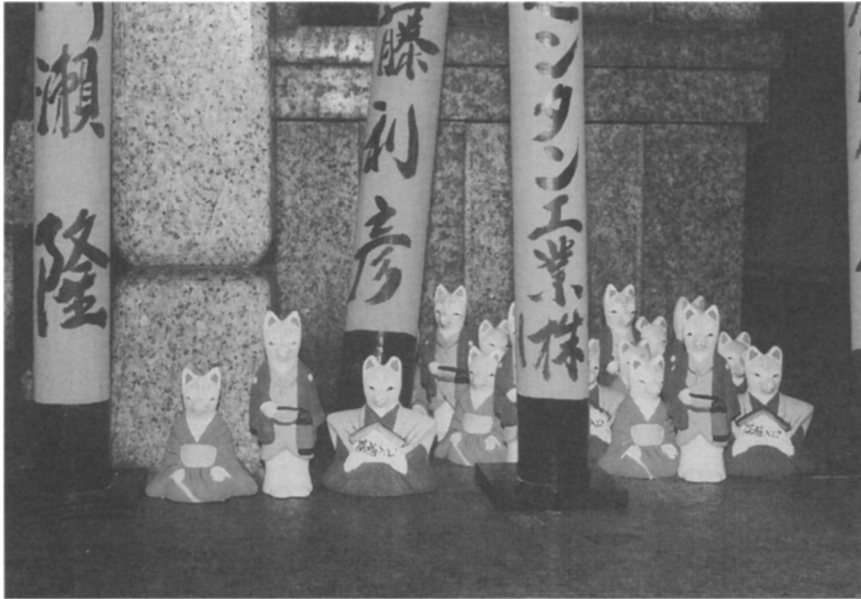
“Kuchi-ire Inari” statues of foxes in traditional Japanese clothing. The statues were prayed to for an addition to the household of a worker or a bride. Edo-period wood-block prints also depict foxes dressed and acting as Japanese people, perhaps suggesting the diversity that constitutes any group.

rules of social politeness. 42 The other symbol of Inari is the “wish-fulfilling jewel” ( nyoi hōju 如意宝珠), which grants not generic wishes but specific personal desires. The word for jewel, tama 玉, also signifies soul ( tamashii 魂), and this is not a group, but an individual spirit.