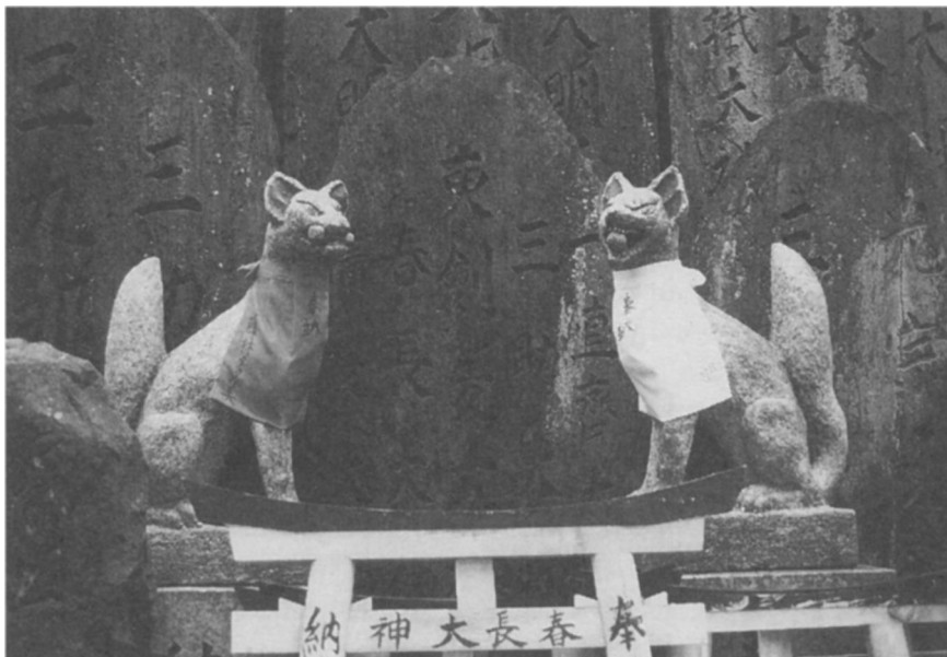
Pair of guardian fox statues in front of a cluster of rock altars ( otsuka ) containing personalized names of the Inari kami. Inari Mountain, Fushimi-ku, Kyoto.

七神蹟) 26 on Inari Mountain, believers set up rocks with what the priests termed “strange names” carved into them. The priests issued their first prohibition in 1869 (Meiji 2), erecting three signboards firmly forbidding the custom. In 1876 they issued another prohibition, but believers continued to haul the stones up in the dead of night. The practice did not abate, and in resignation, in the second month of 1877 the shrine applied to the government for permission to set up the stones, which was granted in the fourth month. Now the custom was seen as a legitimate form of worship by the priests, who began to regulate the custom. By the year 1897 (Meiji 30) the notion of “my own Inari” was firmly entrenched at Inari Mountain (TORIIMINAMI 1988, pp. 147–48).