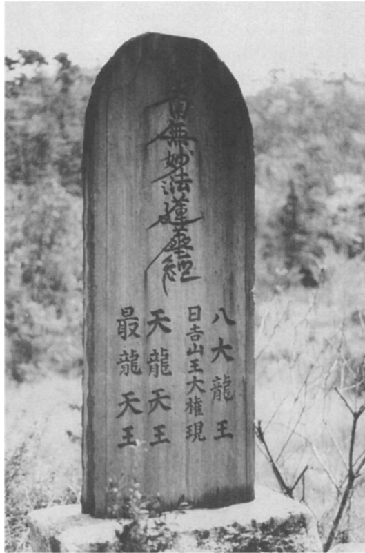
Hōtō , Nichiren version of otsuka , at Saijō Inari, Okayama. Tennō are the 77 assistants to the central deity, Saijōi Kyōō Daibosatsu, at this temple of Lotus Sūtra and Inari devotion.

Toyokawa Inari does not have the practice of setting up such altars (although there is at least one otsuka -like stone at the branch temple in Tokyo). It is for this reason that worship at Toyokawa Inari has a dif-