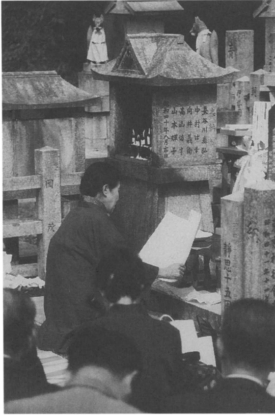
Shamaness and her followers conducting worship at their own otsuka altar on Inari Mountain. The service involves no Shinto priests, although the group may request a formal gokitō prayer service by the priests at the shrine before they climb the mountain.

lems disappeared, and she and her mother shifted their business to property management.